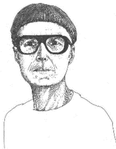
MATALI CRASSET - Translator -